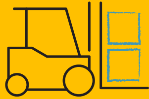
Material Handling and Storage