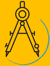
Design and Development