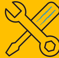
Repair and Maintenance